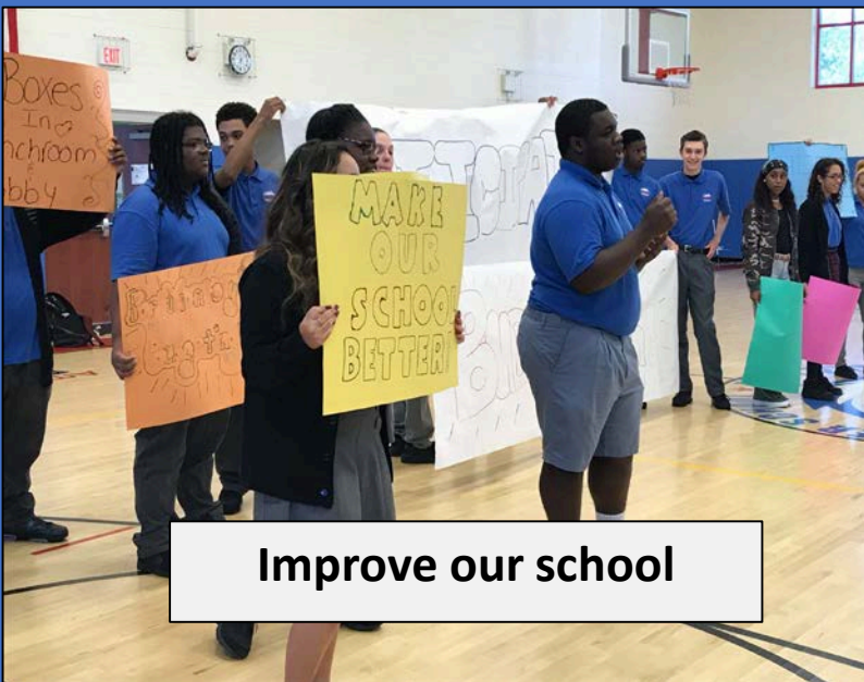
Improve our school