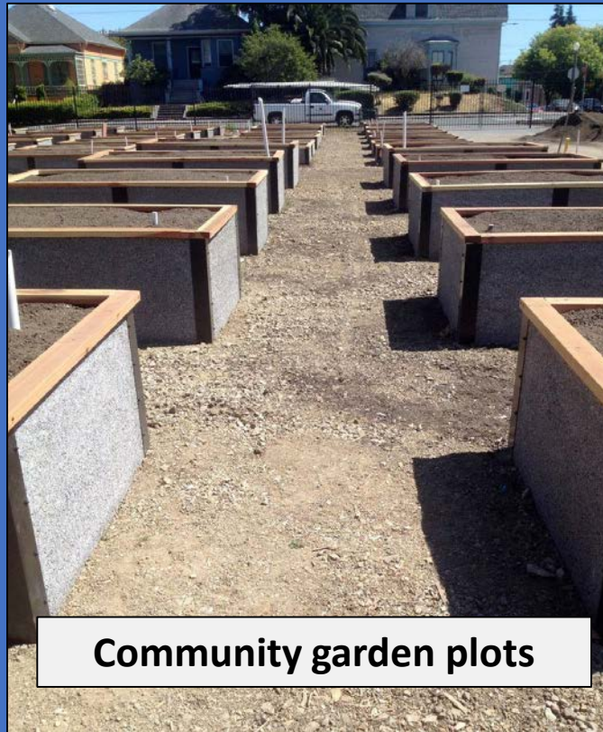
Community garden plots