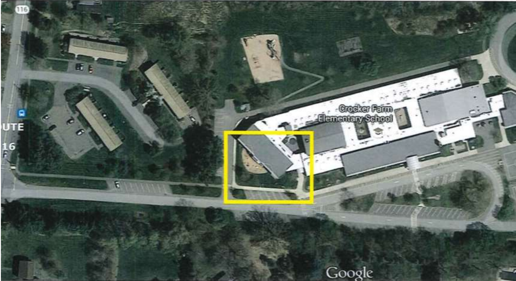
PRESCHOOL PLAY AREA AT CROCKER FARM ELEMENTARY SCHOOL