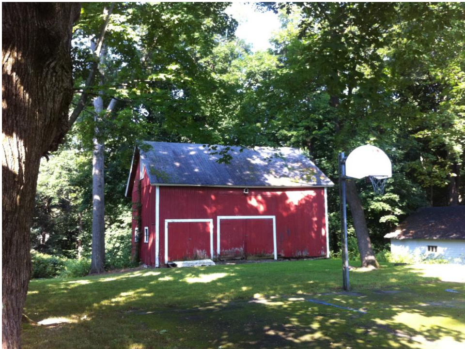
Carriage barn at 90 N. Prospect Street

Amherst College Centennial Biographical Record 1821-1921 (1927), online at http://www3.amherst.edu/~rjyanco94/genealogy/acbiorecord/menu.html