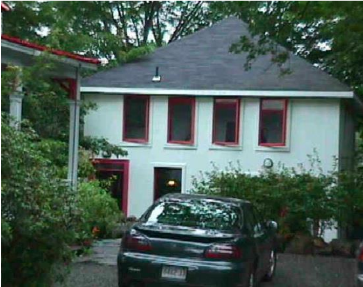
Carriage barn at 71 North Prospect Street, now B&B accommodation.