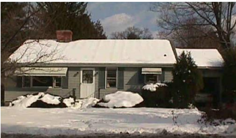
Older photo from town property card, date unknown