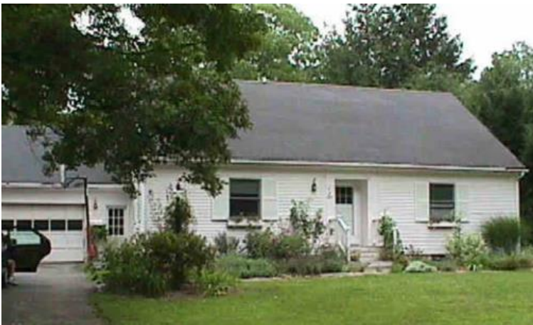
Photo from town property card, date unknown.