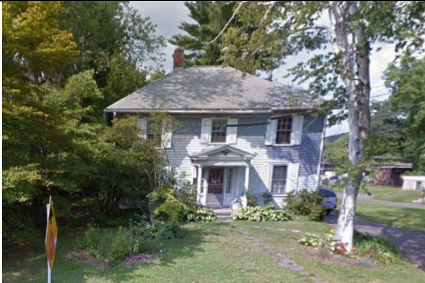
August 2015 Google Map Image