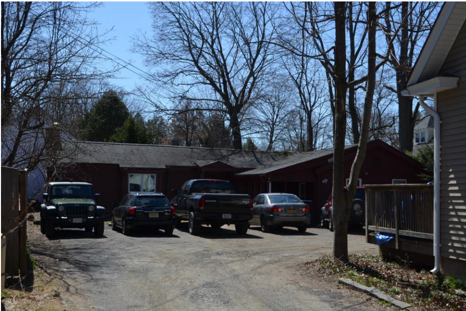
17 Cosby Avenue, AMH.1273