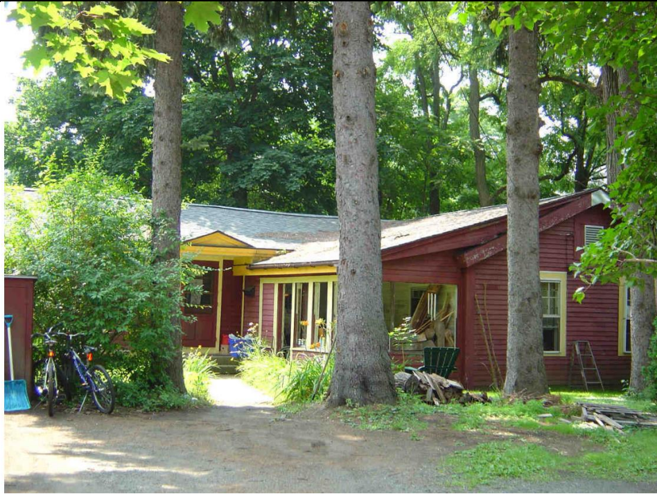
17 Cosby Avenue, AMH.1273 (Assessor's database, c2005).