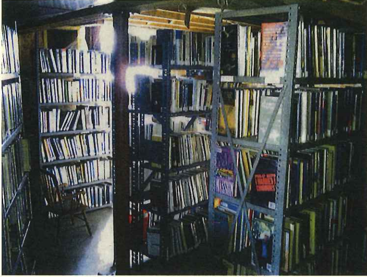
North Amherst Library Basement, showing stacks.