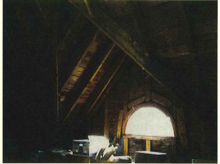
Top floor.